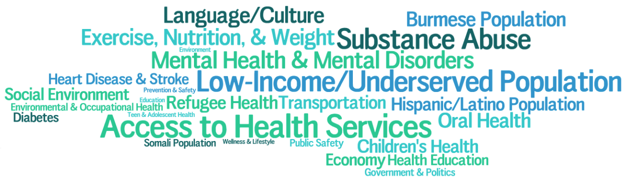
Figure 5.3: Word Cloud of Themes Discussed by Key Informants

Figure 5.3 presents a word cloud, created using the tool Wordle. 4 The word cloud illustrates the topics that were discussed in the key informant testimony; concerns that were mentioned more frequently are displayed in larger font. Key informants discussed concerns surrounding Access to Health Services, Low-income/Underserved Population, Substance Abuse, Mental Health and Mental Disorders, and Language/Culture most often.