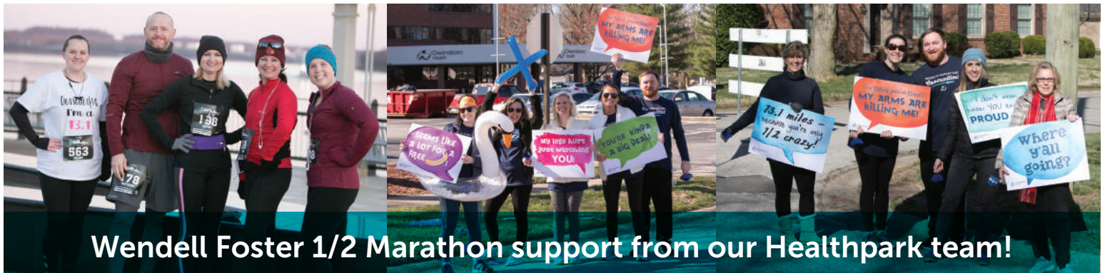
Wendell Foster 1/2 Marathon support from our Healthpark team!

NUTRITIONAL INFORMATION: (Amount per 1/2 cup serving) Serves: 12, Calories: 115, Fat: 2g, Carbohydrates: 10g, Sodium: 57mg, Fiber: 3g, Protein: 3g